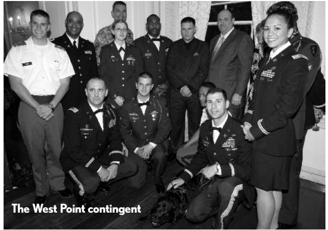
The West Point contingent