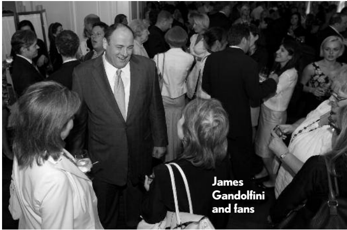
James Gandolfini and fans