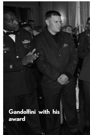
Gandolfini with his award